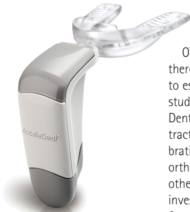
Fig. 1: AcceleDent from OrthoAccel Technologies Delivers a vibrational frequency of 30 Hz requiring 20 minutes daily wear time.

As mentioned previously, the most common, commercially available, vibration device for orthodontic treatment is AcceleDent manufactured by OrthoAccel Technologies (Fig. 1). This device delivers a vibrational frequency of 30 Hz and requires 20 minutes per day user wear time.